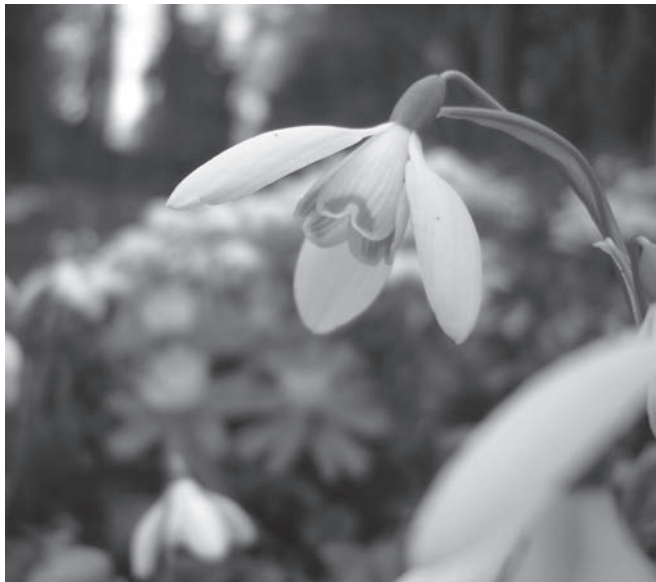
Snowdrop in the wilderness, Rauceby Hall Gardens